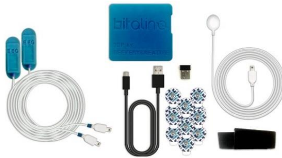
Fig. 1 NeuroBIT bundle.

This convenient pre-assembled bundle is designed for basic EEG data acquisition (e.g. activity in the frontal lobes). NeuroBIT is fitted with Bluetooth communication. The two EEG sensors with SnapBIT-DUO allow easy placement on the subject and repeatedly accurate & fast measurements. A reference electrode cable is also included in this bundle. This bundle is complete with 3D Printed Casing for our BITalino (r)evolution Core BT making it more wearable, shareable & transportable. The kit is provided with a headband to help secure the sensors in the right place, although it is also possible to use our Adjustable Silicon Cap for EEG .