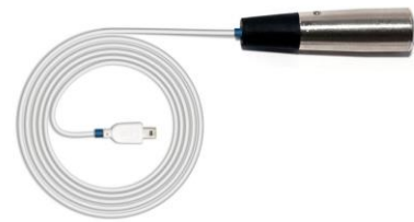
Fig. 1. Ergonomic handheld design.

The use of this accessory to trigger the start of an acquisition is only supported on 8-channel biosignalsplux hubs as it must be required to the digital / accessory port of the biosignalsplux device for this purpose.